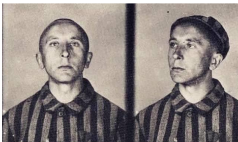
HOLY 40 PROJECT

In the evening of the first day of the week, the doors were closed in the room where the disciples were, for fear of the Jews. Jesus came and stood among them. He said to them, 'Peace be with you', and showed them his hands and his side. The disciples were filled with joy when they saw the Lord, and he said to them again, 'Peace be with you. 'As the Father sent me, so am I sending you.' After saying this he breathed on them and said: 'Receive the Holy Spirit. For those whose sins you forgive, they are forgiven; for those whose sins you retain, they are retained.'